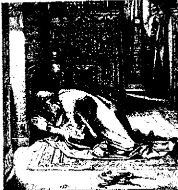
Daniel's Prayer (1865) by Sir Edward Poynter (English neoclassical painter, 1836-1919), from illustrations for Daniel's Bible Gallery . Relief print on paper, 190 x 175 mm, Tate Collection.

The basis for a Daniel Fast is found in Daniel 10:2-3.